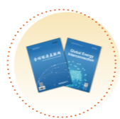
Journal of Global Energy Interconnection (Chinese and English Versions)